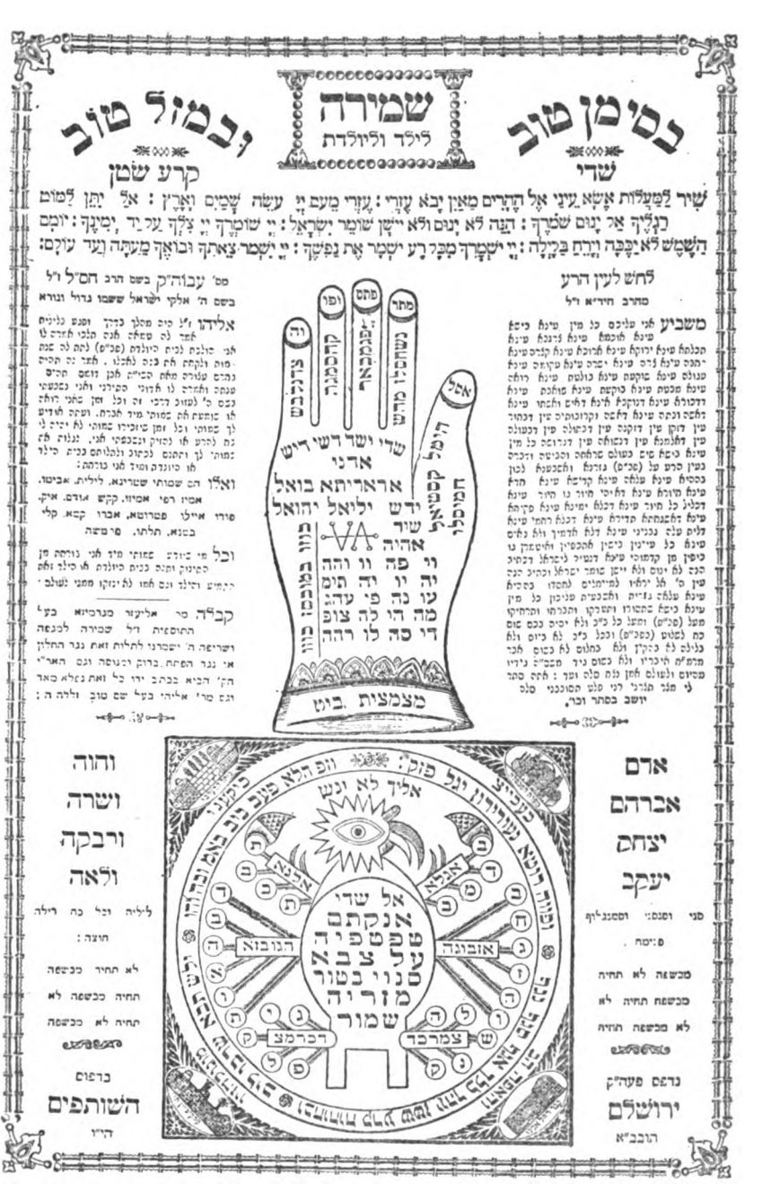
Facsimile of a Hebrew amulet printed at Jerusalem, and guaranteed by various Rabbis of note as an infallible protection from the Evil Eye, Lilith, etc., explained on p. 322 ff.